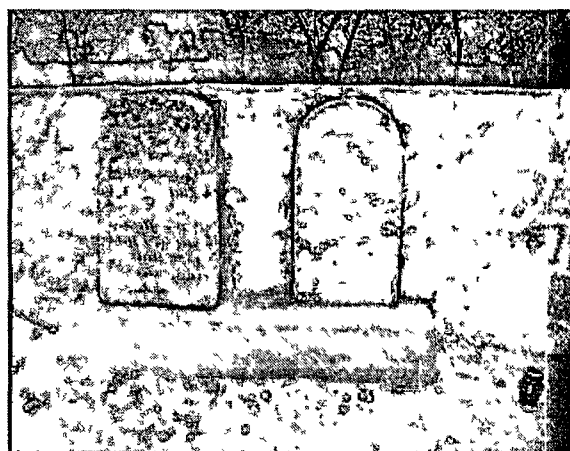
Old monuments discovered during restoration

Perhaps, important to all of us on this project is that we, the children, did return. And we spoke for the dead and for those murdered in the Holocaust.