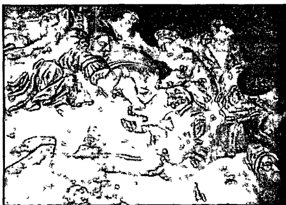
Painting in Cathedral at Sandomierz

We stopped at Sandomierz, a famous and beautiful medieval city near Zawichost. We visited the Cathedral there. I was surprised, but not shocked, to see a large painting portraying stereotypically sinister looking Jews taking blood from the bodies of plump babies. My translator told me that this had been commissioned in the 1600s, when a local Jewish leader had been accused of blood libel. I took photos. Several people in the Cathedral told me to stop taking photos; it wasn't allowed. I didn't care, and wasn't particularly concerned about the light from the flash damaging the painting's surface.