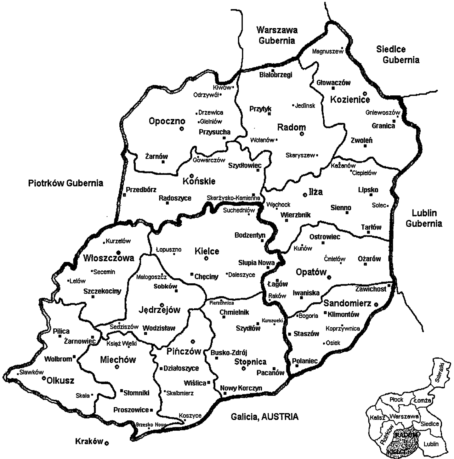
Kingdom of Poland, with Kielce and Radom gubernias shaded.