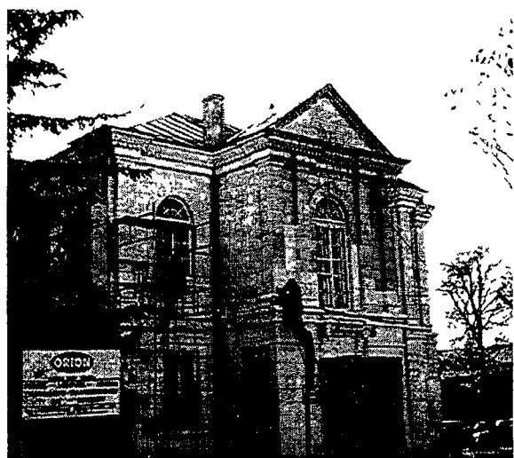
Busko Zdrój Synagogue, built 1929

I visited the synagogue, or its remains, which is located at 6 Partyzantow Street. It is a concrete