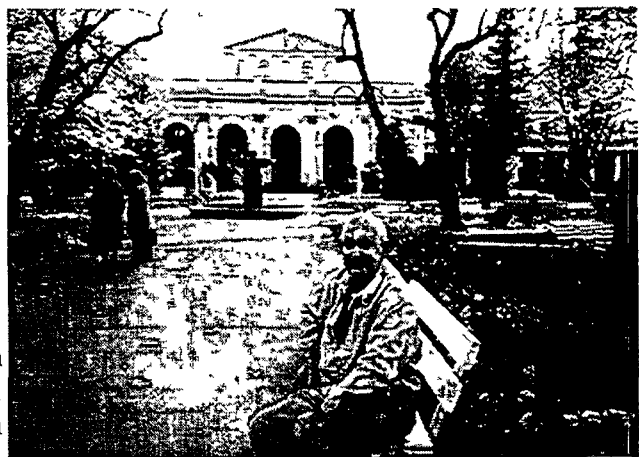
Marconi Resort, 2000.