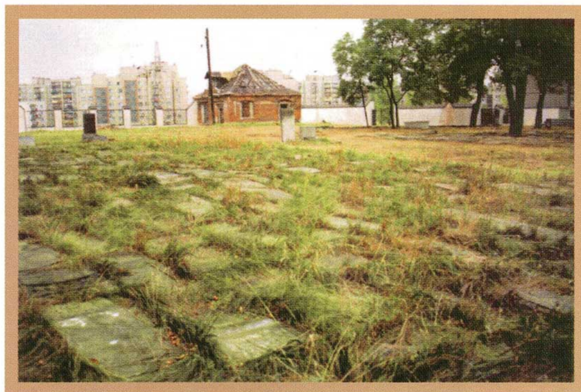
■ Cemetery, ul. Podmiejska, 1994