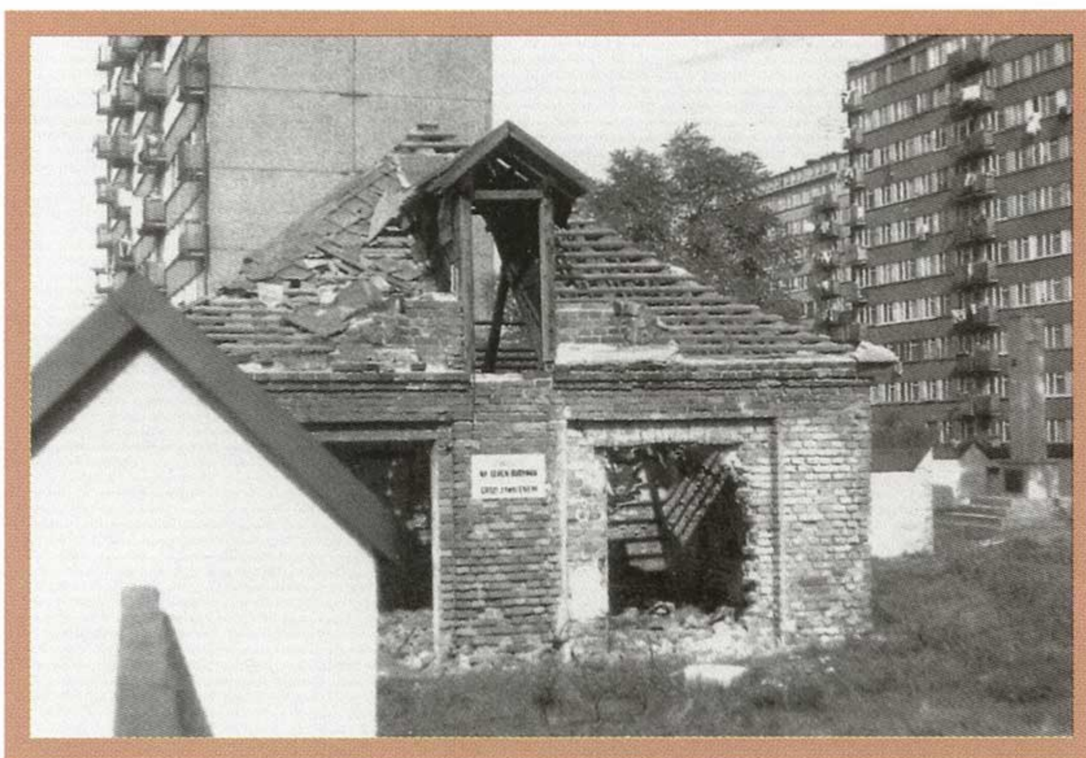
■ Jewish cemetery, ul. Podmiejska, ruins of pre-burial building, 1990