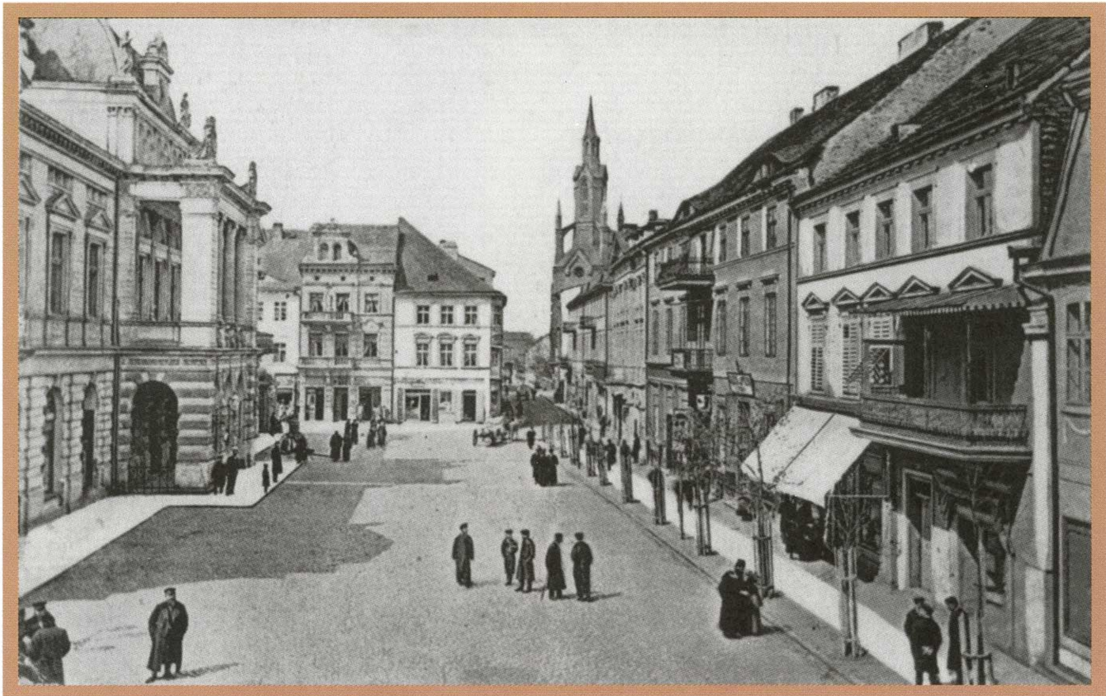
Market square, c. 1918