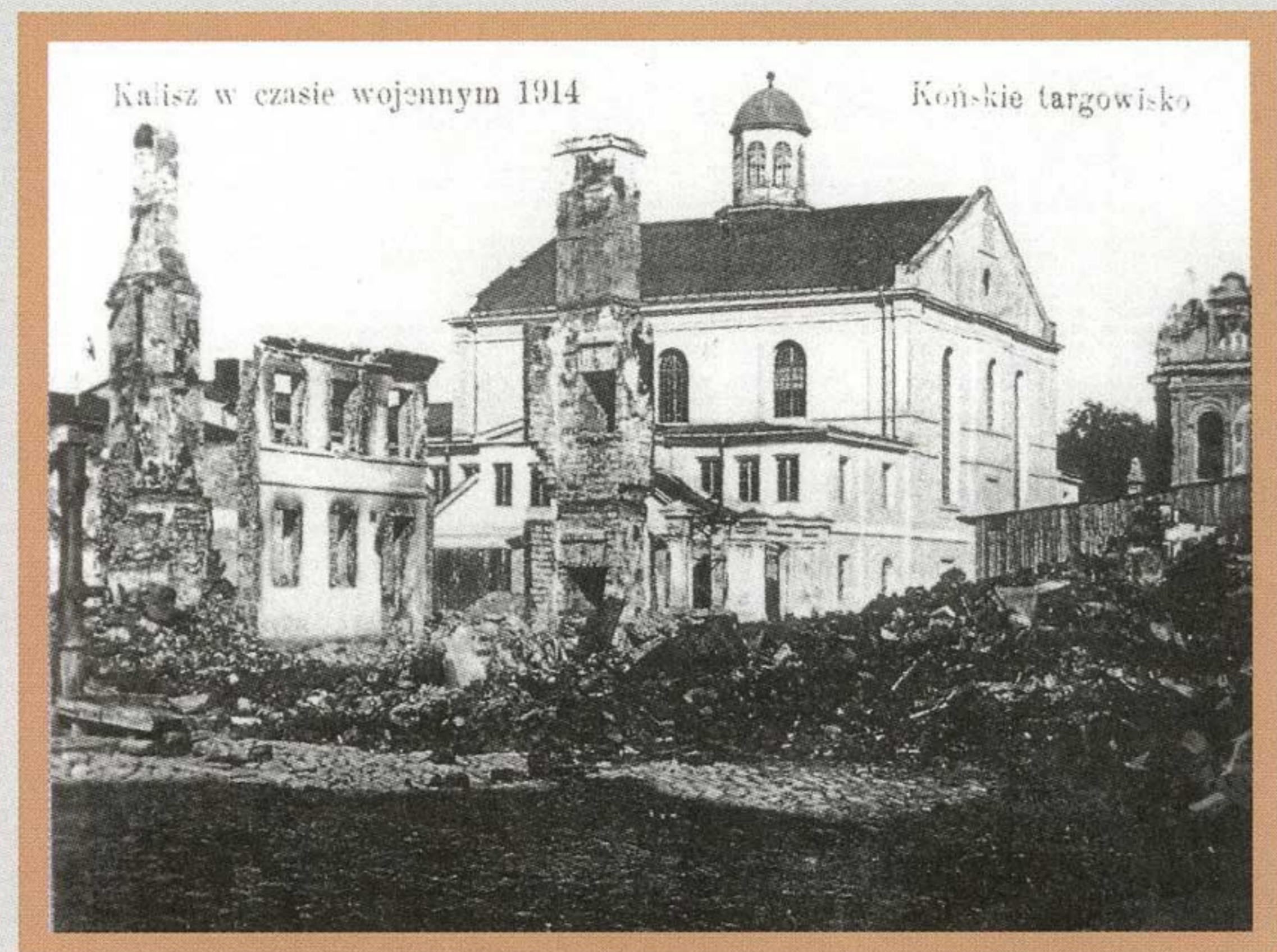
■ Synagogue (in background), ul. Złota, 1914