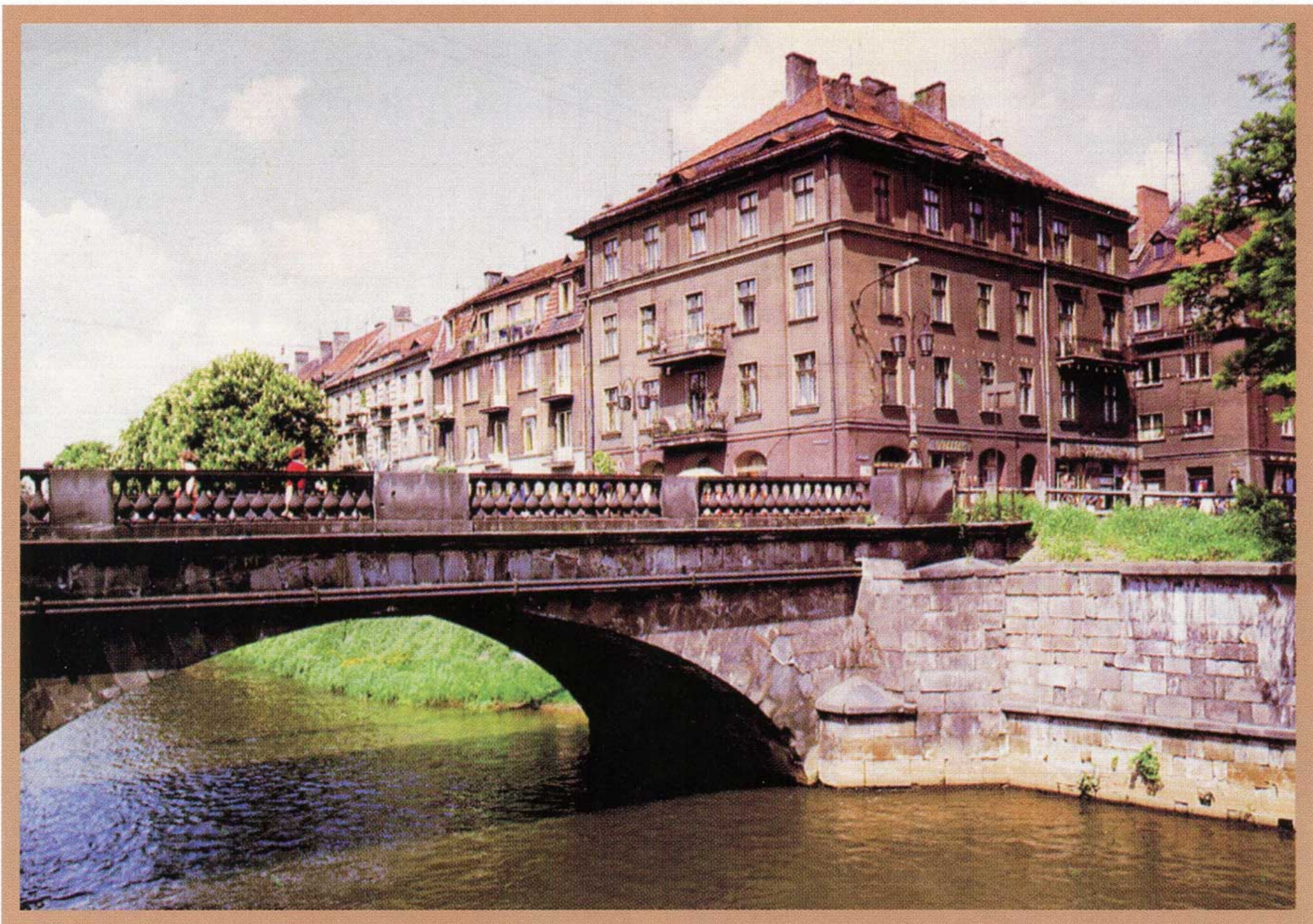
Local view, today