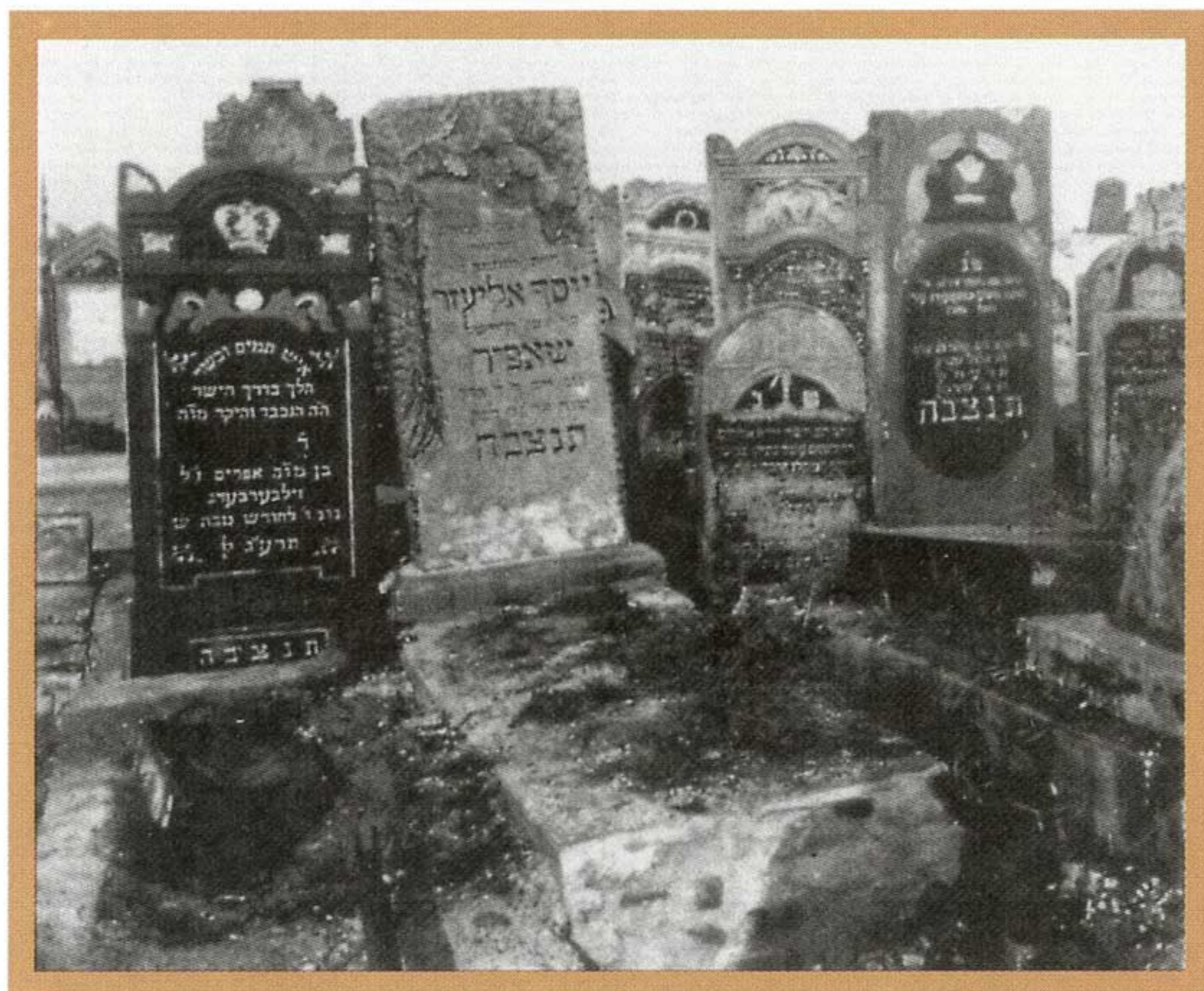
■ Cemetery, ul. Nowy Swiat, pre-1939

Synagogue dating to 1264; destroyed during the Holocaust.