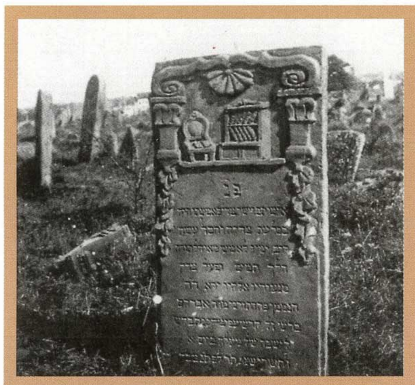
■ Cemetery, ul. Nowy Swiat, pre-1939