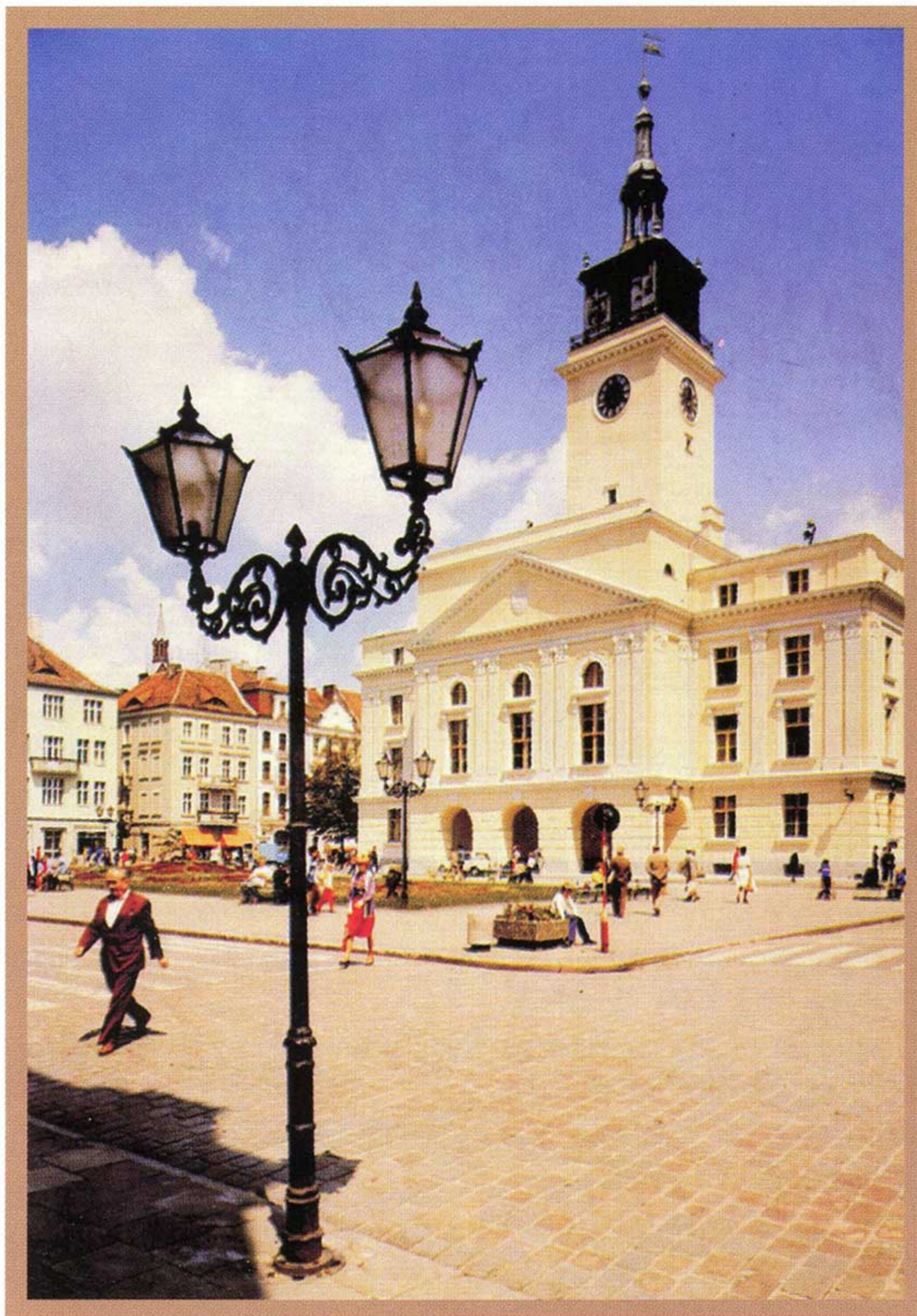
■ Town hall, today